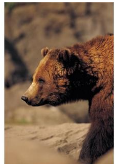
Grizzly - Stock Photo

Seeley Lake Community Council • PO Box 30 • Seeley Lake, MT 59868