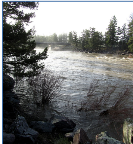
The mighty Blackfoot in late May

For more information, please call me at 677-3398. Please send a letter of support "To Whom It May Concern" addressed to Seeley Lake Community Council Trail Committee, Box 30, Seeley Lake MT 59868.