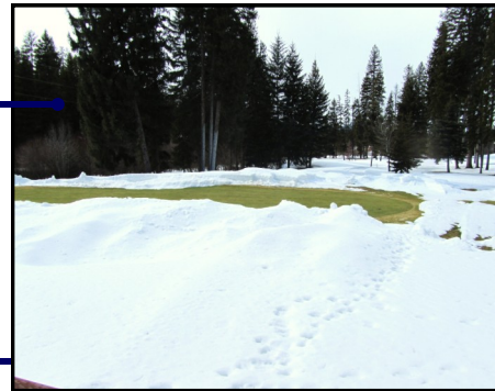
Double Arrow Golf Course gets ready for the season. A hopeful sign for all of us.