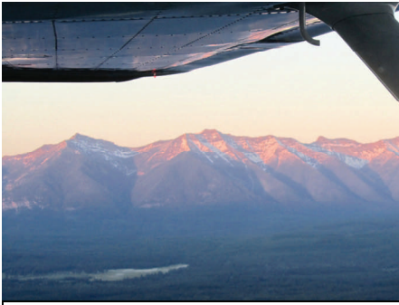
Swan Range at sunset.