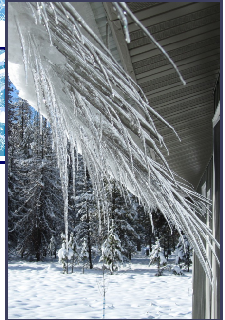
Seeley's sideways icicles in December

Let's all pick a few of these to work on ... and share them with a neighbor! THE END