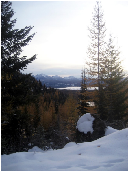
View of the Swan Range from above Marshall Lake