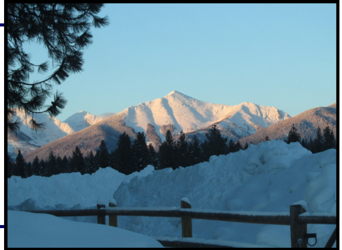
Swan Range in all its winter glory.