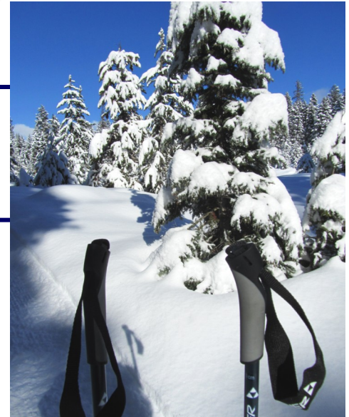
World Class Cross Country trails