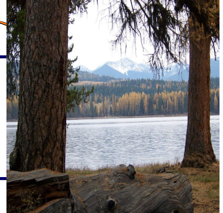
Seeley Lake