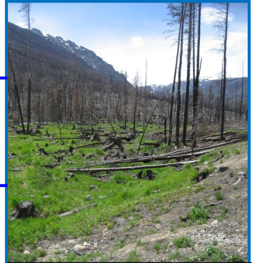
Summer in the high country of Montana.