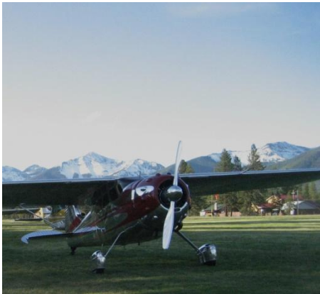
Montana Antique Aircraft Assn. fly-in hosted by SL Airport Foundation on June 18.